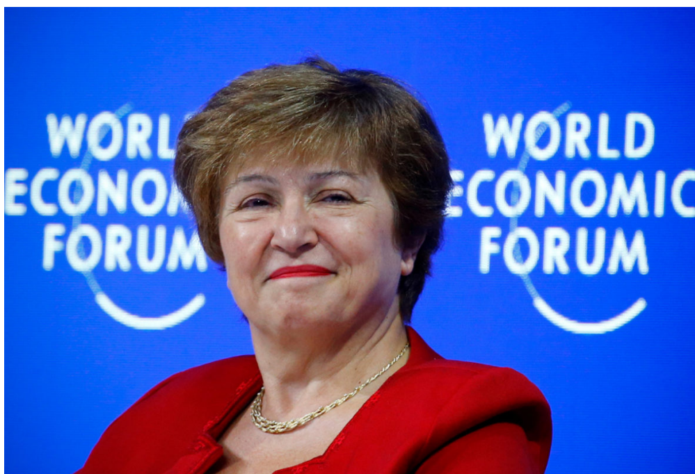
(Pictured: Kristalina Georgieva)

The director of the International Monetary Fund (IMF), Kristalina Georgieva, was in France this past Wednesday and admitted "we were proven wrong: wrong when Omicron hit, wrong when Russia invaded Ukraine, wrong when during this summer, climate shocks [affected] agricultural productivity."